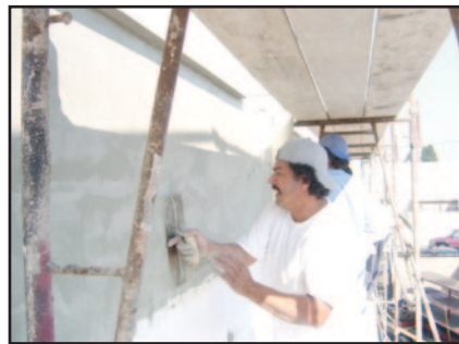
TROWEL MESH INTO BASE COAT