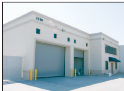
FINISHED ICF STUCCO PROJECT