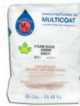
FOAM BASE COAT

Proper expansion joints, weep screeds, control joints should be placed based on local building codes.