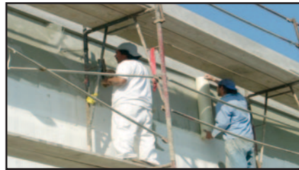
EMBED FIBERGLASS MESH INTO BASE